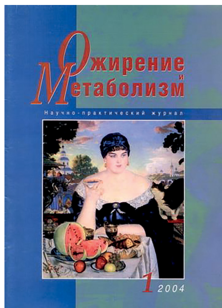
Cover of the first issue "Obesity and Metabolism." Vol. 1, No. 1 (2004)

The cover features a painting by Kustodiev B.M. "Merchant's Wife at Tea", 1918 (paintings by artists on the covers became a 'calling card' for the journal).